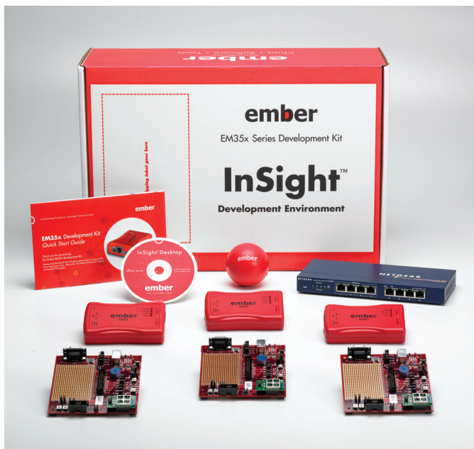
EM35x Development Kit